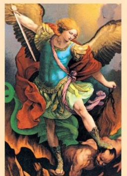
ST. MICHAEL THE ARCHANGEL Pray for us.